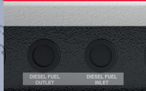
INPUT/OUTPUT FUEL PIPE

the engine is cooled by a coolant loop in a closed circuit. The system consists of a heat exchanger, inside which the heat exchange between coolant and sea water takes place. Two separate pumps provide for the circulation of coolant and seawater. Air flows ensure effective cooling of the alternator. The excellent accessibility makes maintenance operations easier, even with the generator installed in confined environments.